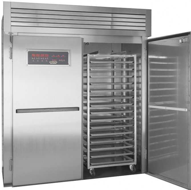
LRP2S-130P (rack not included)